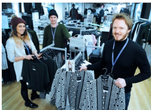
Retail staff who are asked to wear the company's own clothes can not claim a tax deduction for those clothes.

If you're unsure about the tax deductibility of your work related clothing, we invite you to contact us to discuss the rules and regulations.